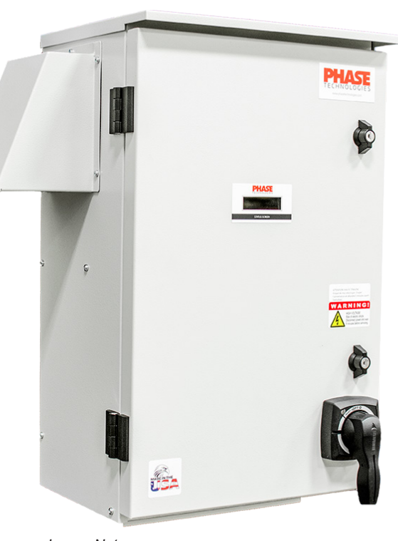
Image Note: System pictured above is equipped with optional MCCB disconnect and NEMA 3R rated enclosure. Other options are available.

The Phase Perfect® is a logical replacement for rotary converters due to the superior cost and operating efficiencies, solid-state design (no moving parts), and long-term protection for sensitive and costly equipment.